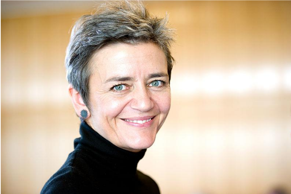
Margrethe Vestager, Executive Vice-President of the European Commission Margrete Vestager, Leading Commission's 'Europe Fit for the Digital Age'

https://ec.europa.eu/commission/presscorner/detail/en/IP_21_1682